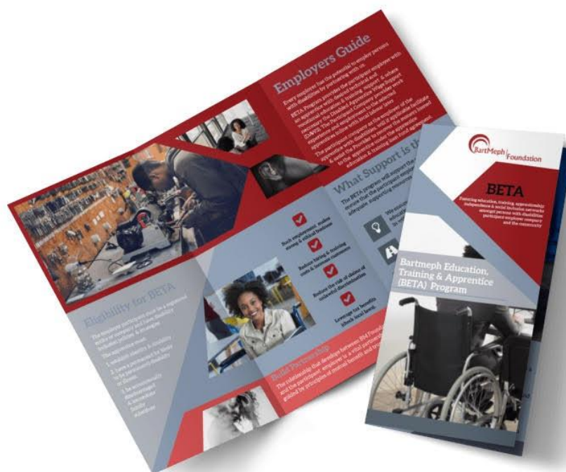
The BartMeph Education, Training & Apprenticeship (BETA) Program brochure.

The BartMeph Education, Training & Apprenticeship (BETA) Program empowers individuals with disabilities through education, training, and employment to achieve socio-economic independence.